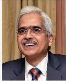
Shaktikanta Das (Chairman) Governor, Reserve Bank of India